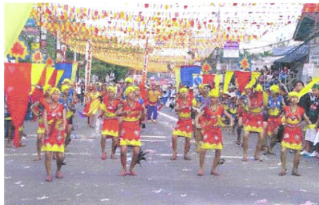
Fluvial parade (left); Sinulog 2003, Cebu's Mardi Gras (center); Rosary at Birhen sa Regla chapel, Buyong (right)