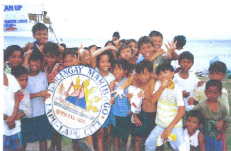
Visiting the Matutinao Church (left); Barangay Clean and Green Volunteers (above); Island hopping (right)